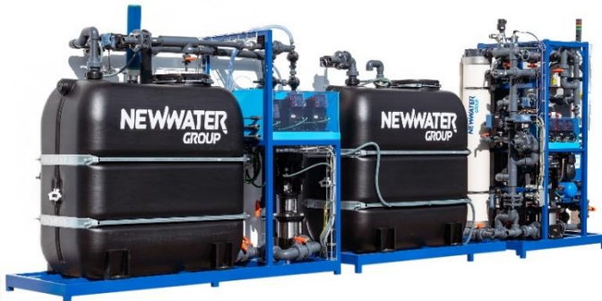
MINT-UF60A with feed water accumulation tank, backwash frame, CEB system and all additional extensions